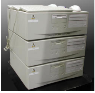
Triple 1Ghz Athlon desktop computers

In closed loop mode, the Micro Simulator's motion is being controlled by the FlightGear software rather than analog feedback from a joystick or foot pedal. This closed loop computer generated input to the Micro Simulator creates a realistic experience based on the simulation software and not simply on the position of the joystick (Open Loop). This is accomplished through the use of "hooks" implemented into the FlightGear software.