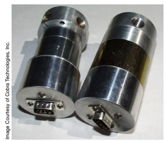
Cobra Technologies Servovalve