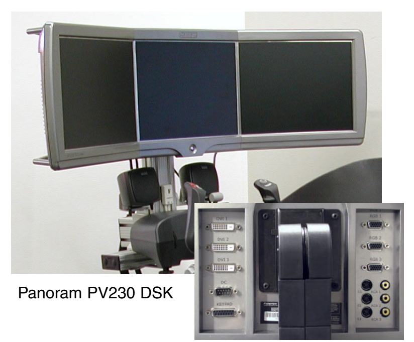
Display Input Panel

The Panoram PV230 DSK provides source flexability with RGB and DVI computer sources as well as Composite and S-video inputs for the demonstrator, the RGB inputs were used.